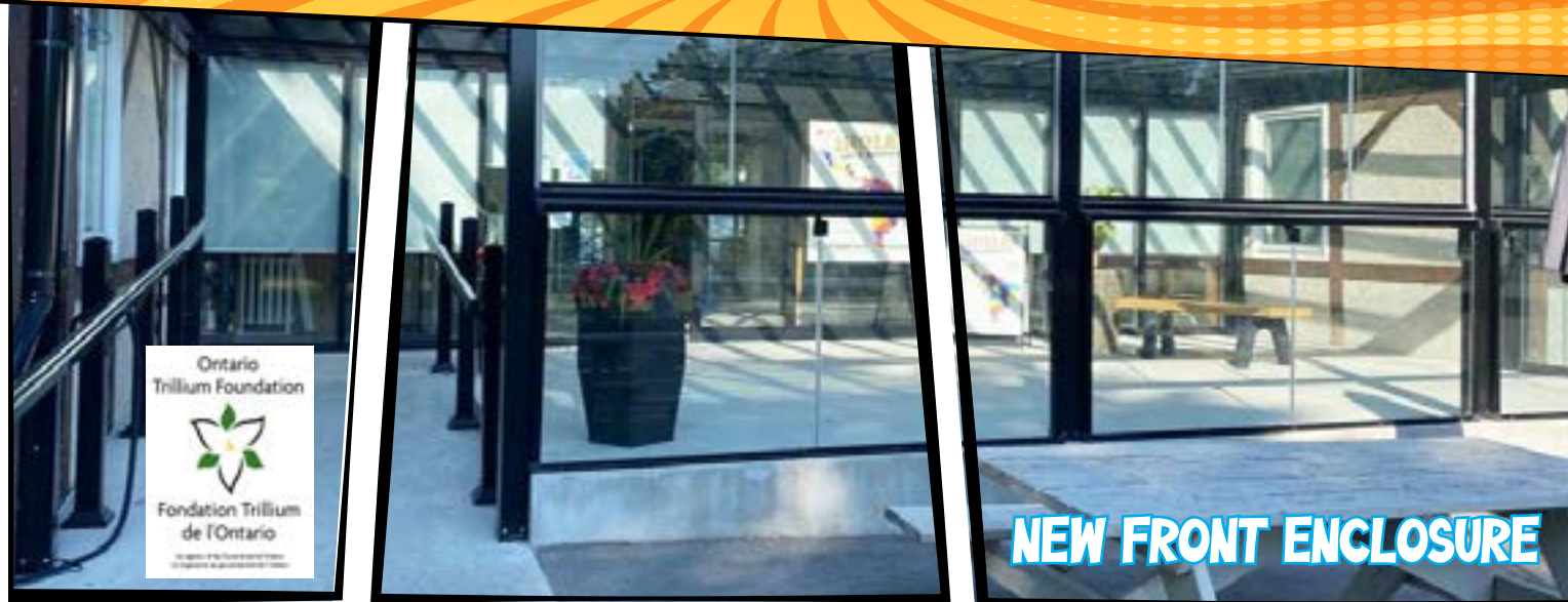
NEW FRONT ENCLOSURE