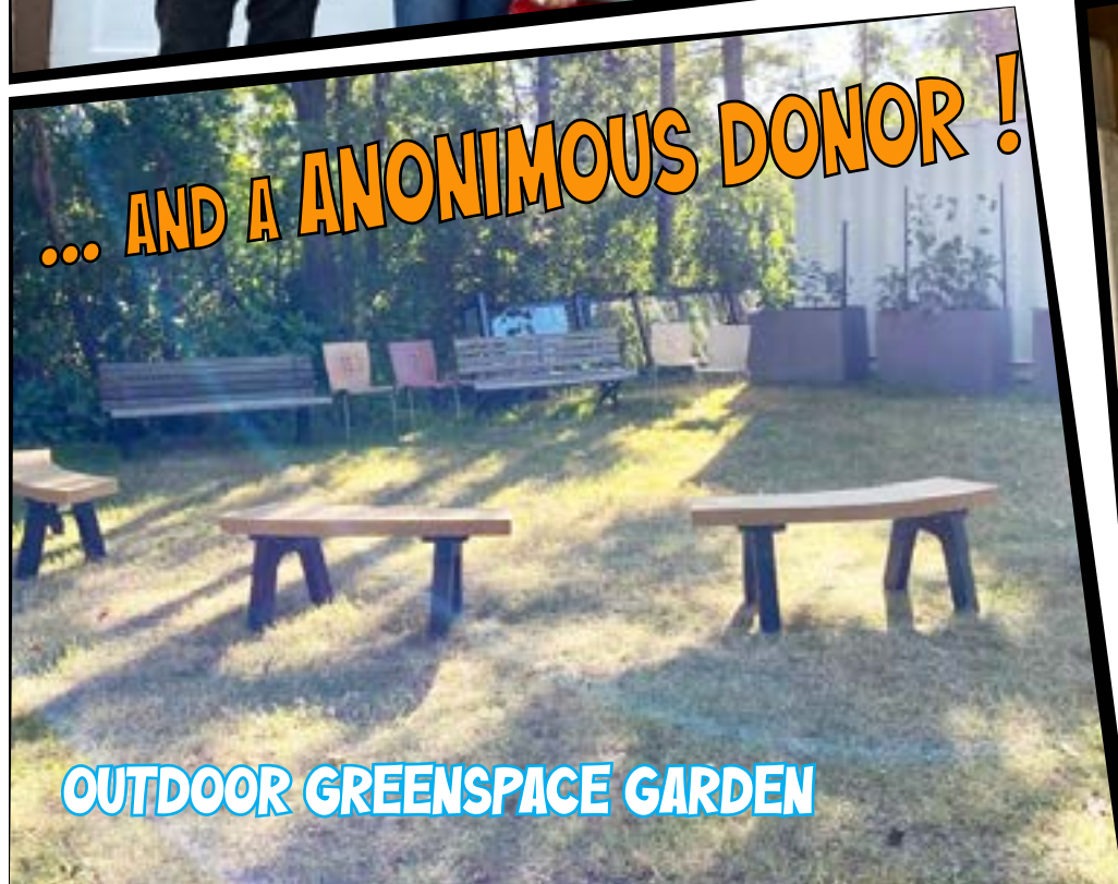
... AND A ANONIMOUS DONOR !