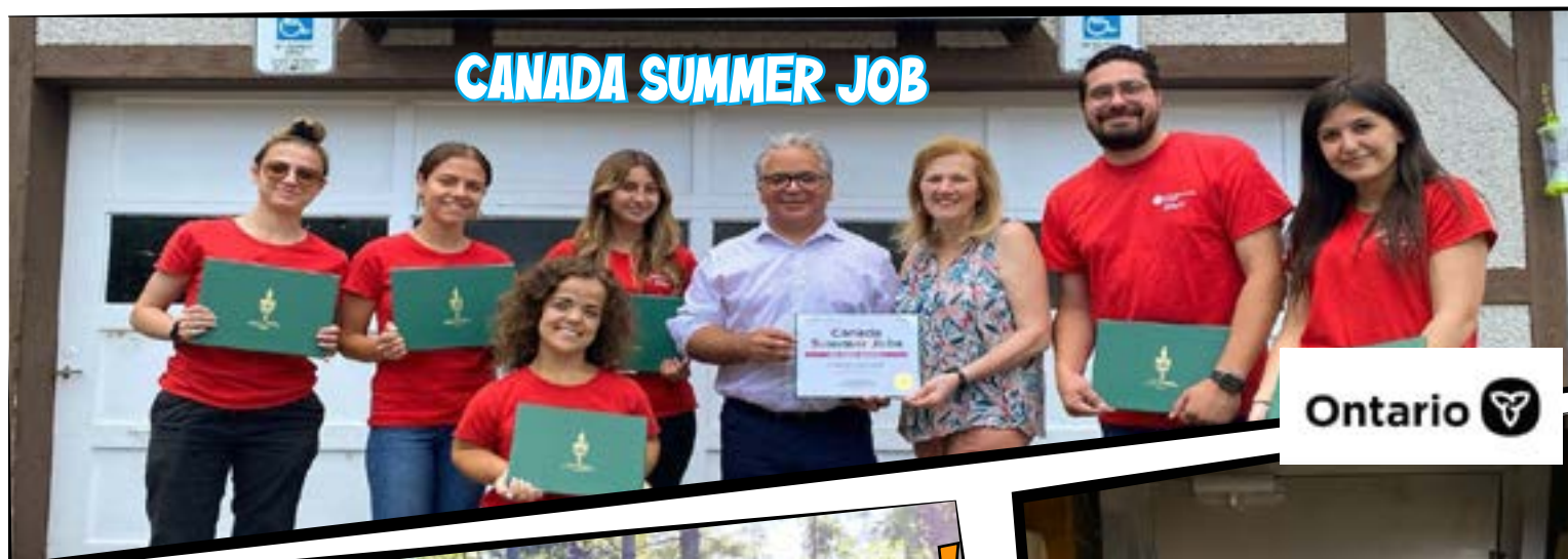
CANADA SUMMER JOB